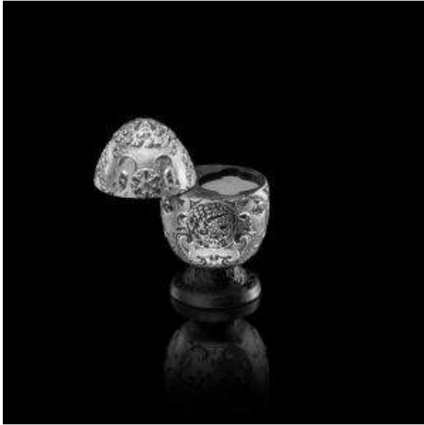
Coin investment packaging can come in a variety of shapes.

A leading provider of holograms for coins and medals helps to make their presentation a stunning experience.